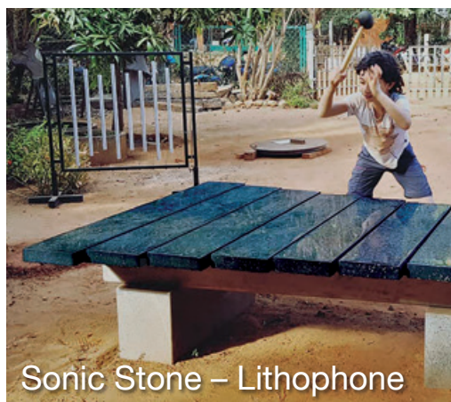
Sonic Stone – Lithophone